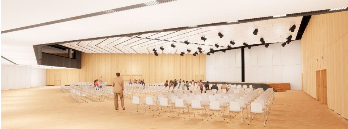
Modernised Hall E and F.

the addition of new wall and ceiling panels, the visitor balconies will be removed, while the interpreter booths will remain in place.